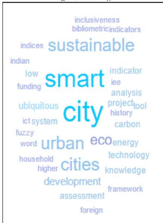
Fig. 1 Cloud of Tags

Figure 1 below shows a cloud of tags with the keywords quoted in the selected articles.